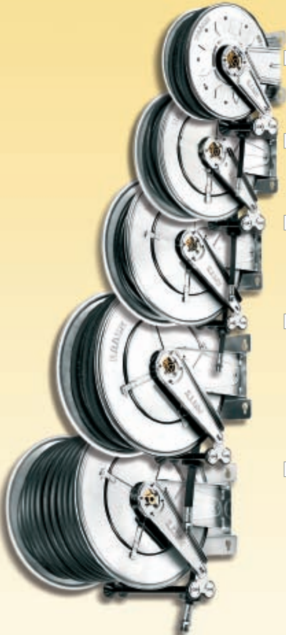
The same models, swivelling version, on page 373